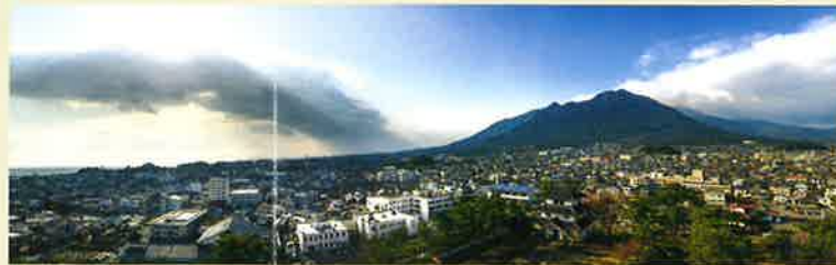
The panoramic view with historical town, Shimabara city