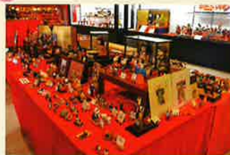
Hinamaguri in the castle town - from early February

Exhibition Hall: It is a space for a special exhibition and seasonal events.