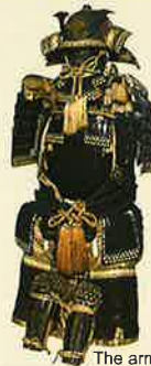
The armour of the feudal lord