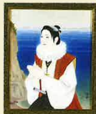
The portrait of Shiro Amakusa