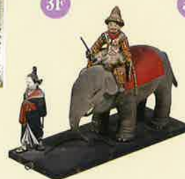
An elephant and southern barbarian