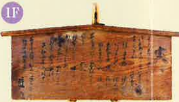
The official bulletin board of prohibition