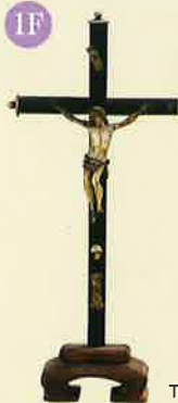
The Coregio altar cross