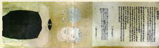
The human anatomical chart